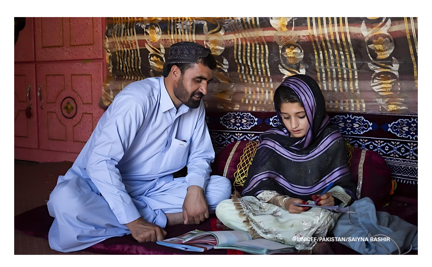
[5] United Nations Children's Fund (UNICEF), World Economic Forum (WEF). (2017). Glossary of Terms and Concepts. https://www.unicef.org/rosa/media/1761/file/Genderglossarytermsandconcepts.pdf.

The synthesis of insights gleaned from KIIs, FGDs, and provincial consultations was augmented by the active participation of duty bearers; service providers; parents; caregivers; adolescent girls and boys; and the transgender community. This process underscores that a concerted effort was made to identify key gender related socio-cultural and structural barriers; and opportunities that would be addressed through the strategy.